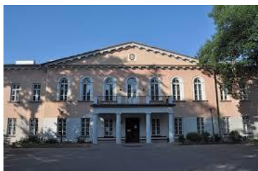
VI Liceum Ogólnokształcące im. Króla Zygmunta Augusta w Białymstoku, Białystok, Poland www.vilo.bialystok.pl