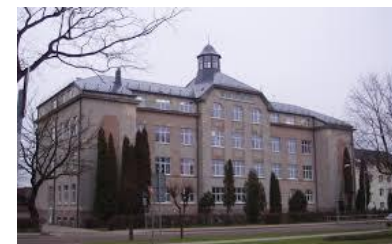
Bauskas Valsts gimnazija Bauska, Latvia www.bauskasvg.lv

This project has been funded with support from the European Commission. This publication reflects the views only of the author, and the Commission cannot be held responsible for any use which may be made of the information contained there in.