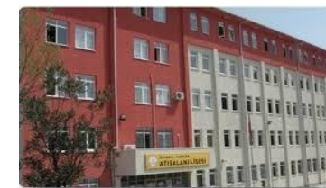
Atısalanı Anadolu Lisesi Istanbul – Turkey http://mebk12.meb.gov.tr/meb_iys_dosyalar/34/33/307747/index.html