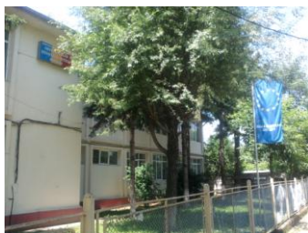
Liceul Tehnologic PETROL Moreni, Romania http://gsip.xhost.ro