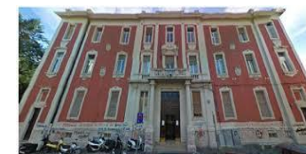
Convitto Nazionale Domenico Cirillo - Scuole Annesse Bari, Italy http://www.convittocirillo.it/