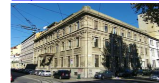
UNIVERSITA DEGLI STUDI DI MILANO, Italy www.unimi.it