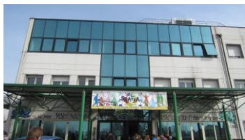
IIS P. SRAFFA – Italy coordinating school www.sraffacrema.it